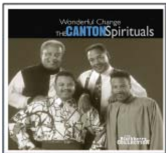
The Canton Spirituals Wonderful Change